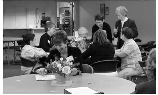
What are they doing at that table?

Don't be the one to miss the next meeting--Saturday, Sept. 17 Be "in the know" with the answers to these and many other mind-boggling IFMC questions.