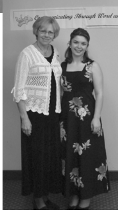
Did you miss this meeting... and this concert?