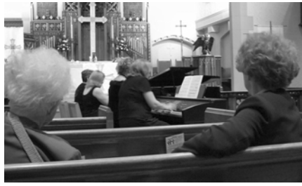
Is this a professional piano quartet?