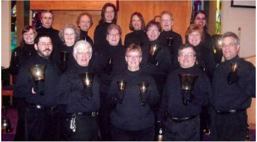
Pictured from left to right

This is only one of the many awards available from NFMC. Is there an award that you, as an individual, or your group is missing?